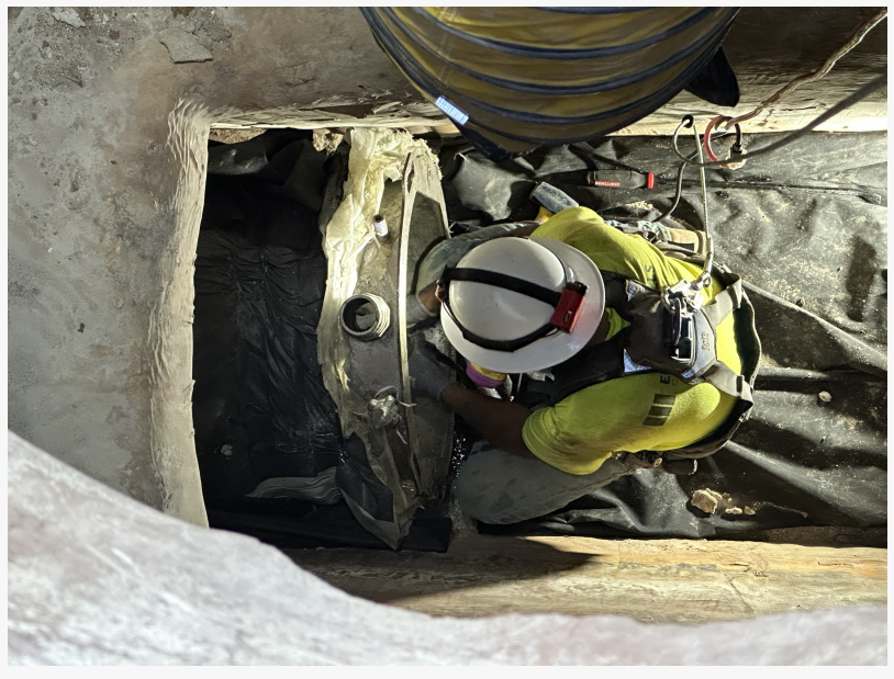
Crew Performing UV-GRP Pipeline Renewal

methods. Reline America offers everything needed for pipeline rehabilitation under one roof—design, engineering, manufacturing, training and 24/7 support from its ISO 9001-2015 certified facility in Saltville, VA. Customized equipment and liners, factory certified installers, coupled with a proprietary Quality Tracker System<sup>™</sup>, make Reline America's ALPHALINER<sup>®</sup> UV GRP liners easier to install. The results are simple to see: greater efficiency and productivity, minimal risk-management concerns, less community disruption and exceptional ROI. Visit www.relineamerica.com to learn more.